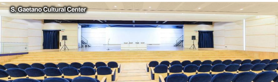
S. Gaetano Cultural Center

Tours to artistically interesting landmarks: Palazzo del Bo' (e.g. Anatomic Theatre, Aula Magna and Galileo's chair), Verona, Venice and the Venetian Villas, along the Brenta river, can be organized, on request, through a local tourist agency.